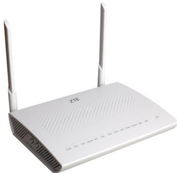
Figure 1-1 The ZXHN F668

The ZXHN F668, a GPON optical network terminal (ONT) for home users, is designed for the fiber to the home (FTTH) scenarios, supports desktop mounting, wall mounting and network cabinet mounting. The ZXHN F668 complies with the ITU-T G.984 standard, provides 2.488 Gbps downlink and 1.244 Gbps uplink at network side, and provides four GE ports, two POTS ports, one 802.11b/g/n(2*2 @2.4G Hz) Wi-Fi interface, one USB interface, and one RF interface at user side. Home users can easily access voice services, video services, CATV service and many other kinds of high-speed broadband services by the ZXHN F668's rich interfaces.